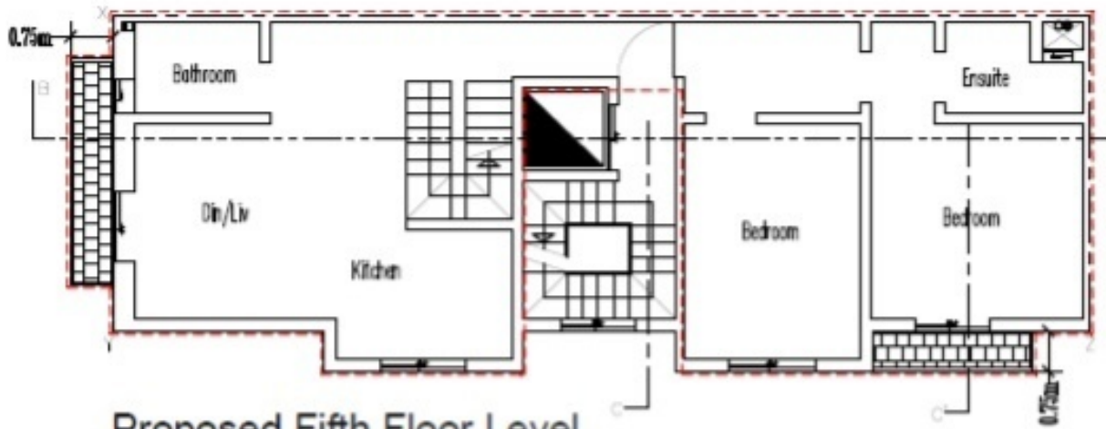
Proposed Fifth Floor Level