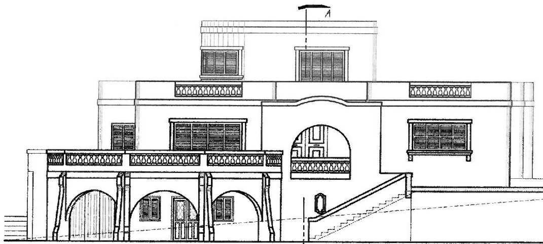
PROPOSED ELEVATION A SCALE 1:100