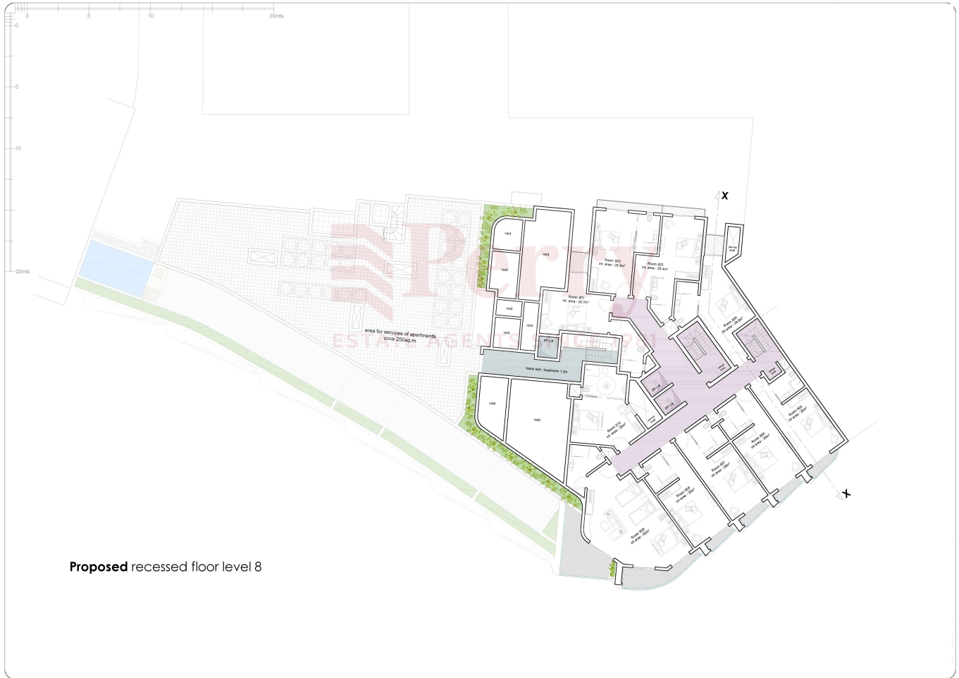
Proposed recessed floor level 8