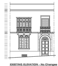
EXISTING ELEVATION - No Changes Scale: 1/100