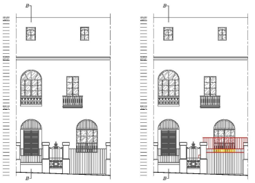
EXISTING ELEVATION Scale: 1/100 PROPOSED ELEVATION Scale: 1/100