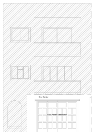
Existing Elevation Scale: 1:100