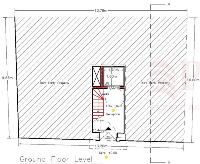
Ground Floor Level Proposed Scale 1:100