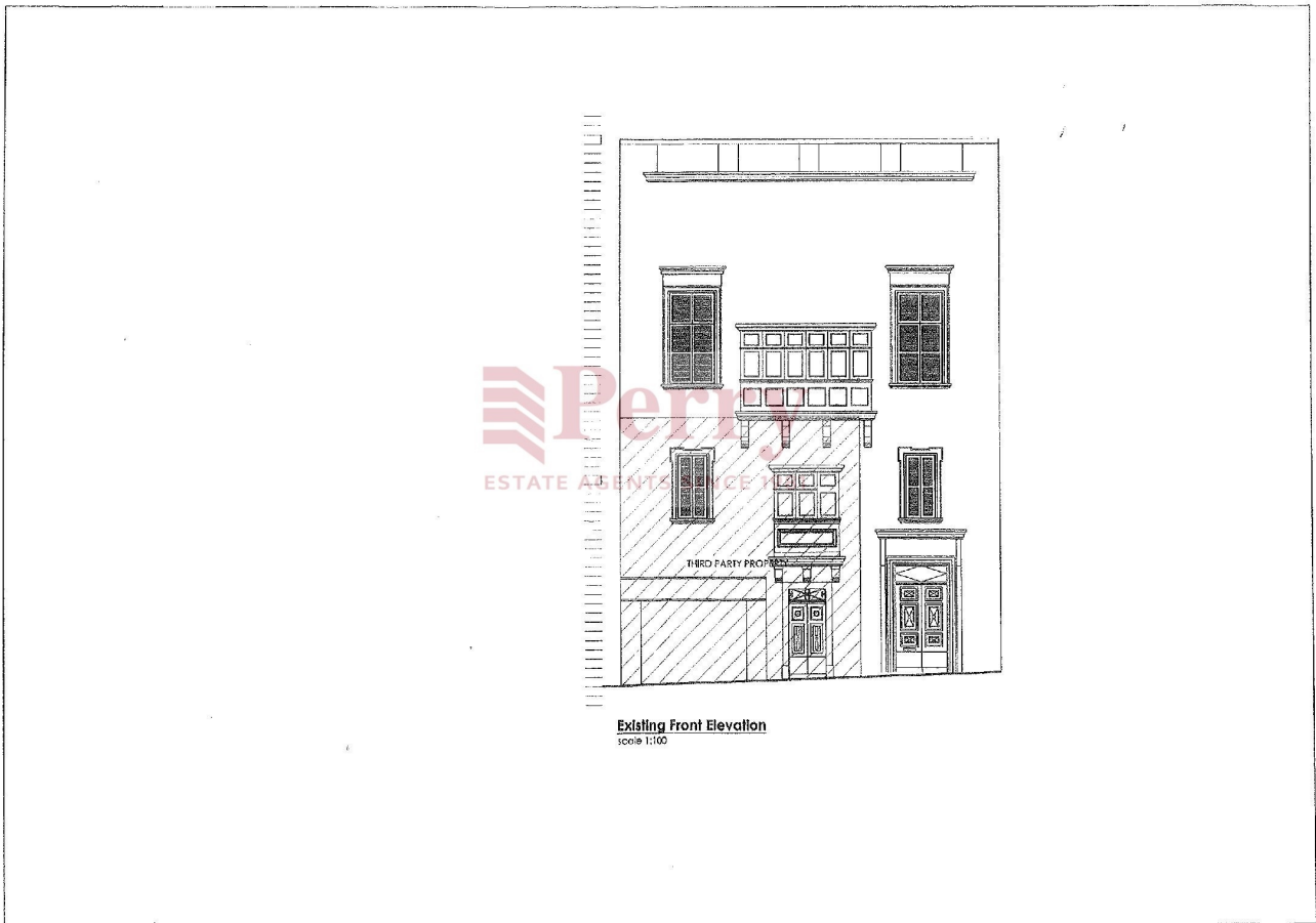
Existing Front Elevation scale 1:100