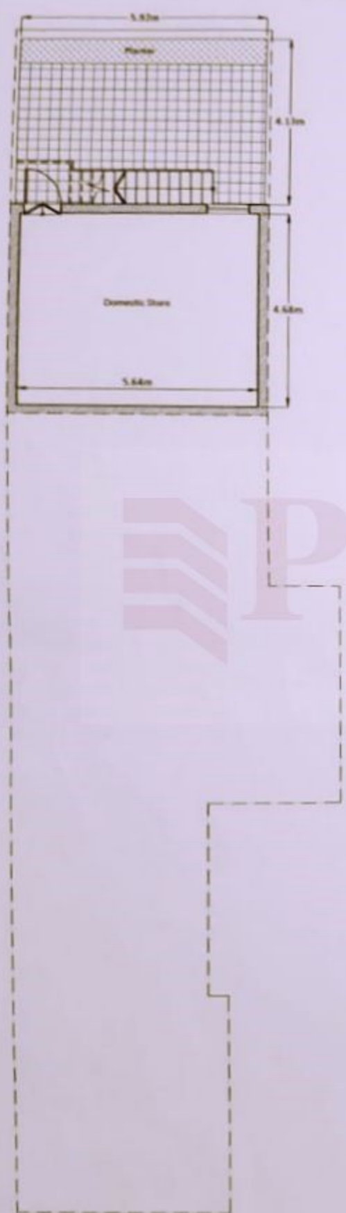
Basement Floor Plan SCALE 1:100