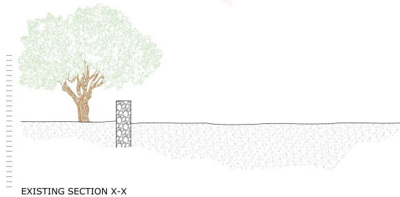
EXISTING SECTION X-X