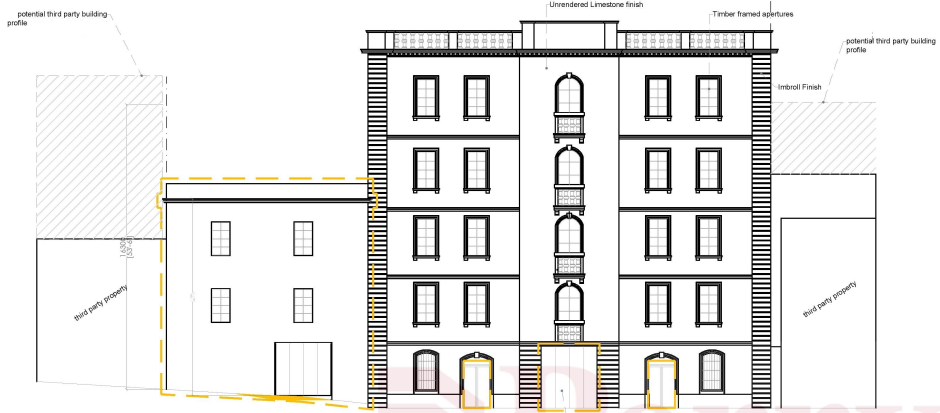
Existing Elevation 1