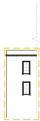
Existing Elevation 2