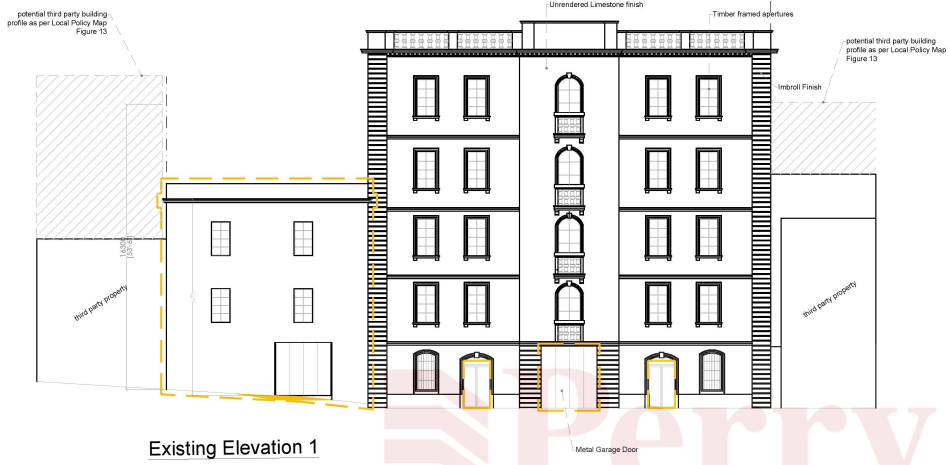
Existing Elevation 1