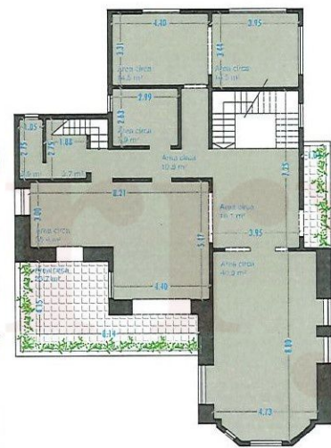
Second floor plan Scale 1:100

■ First floor_Gross Floor area circa 227 m 2