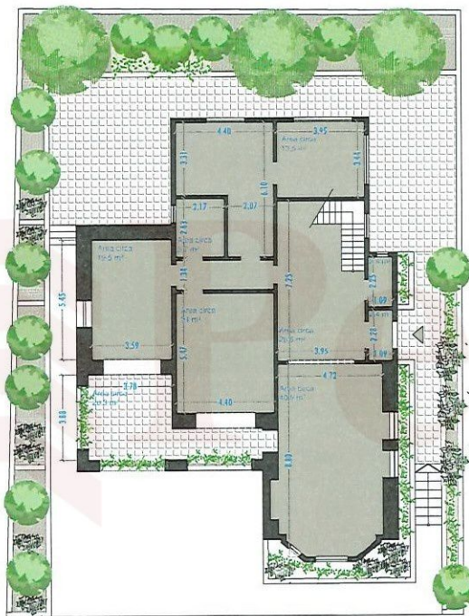
First floor plan Scale 1:100

■ site area 560m 2 Ground Floor_Gross Floor area circa 101 m 2