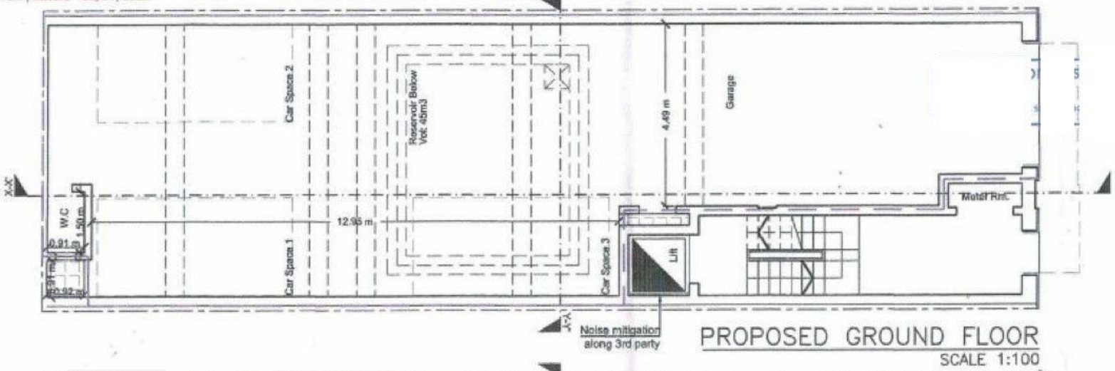
PROPOSED GROUND FLOOR SCALE 1:100