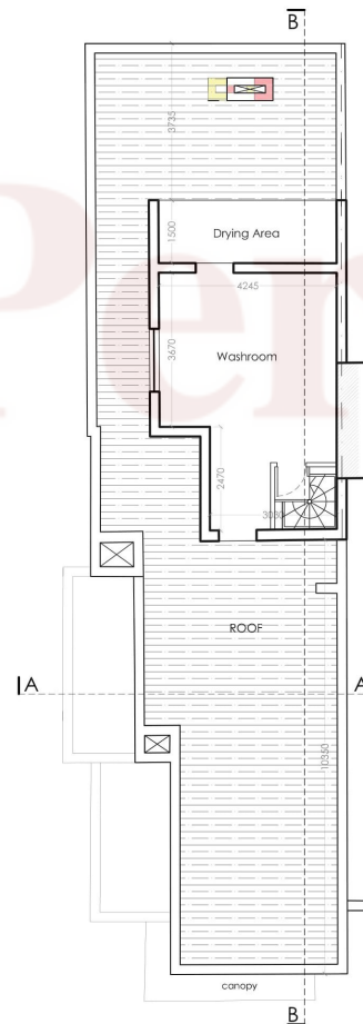
ROOF PLAN SCALE 1:100 AREA: 27m 2