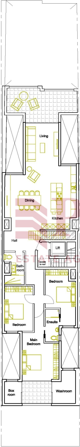
Setback floor plan Scale 1:100