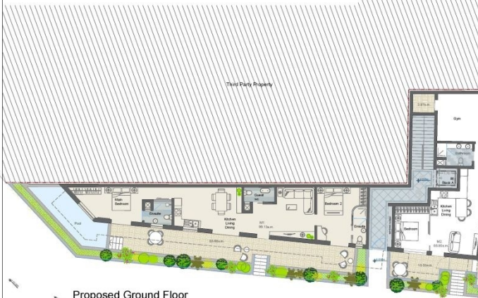
Proposed Ground Floor 1:100