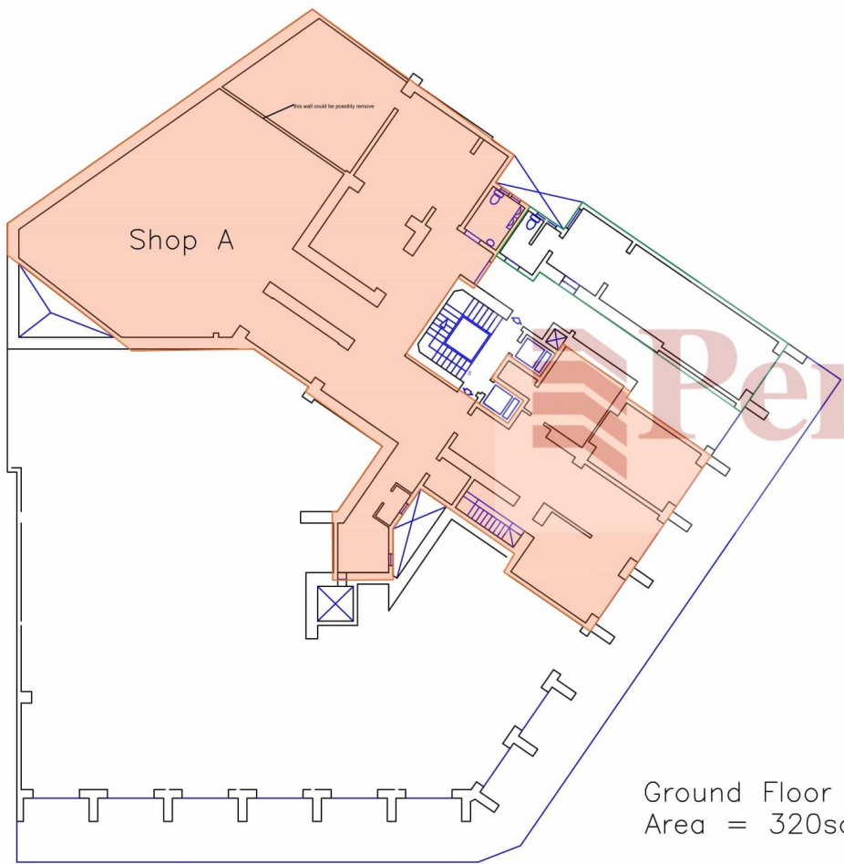
Ground Floor Area = 320sqm