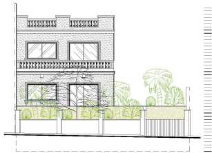
Front Elevation (B) Scale 1:100